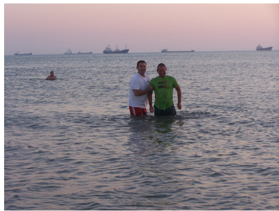
Joyfully coming out of the water of baptism August 22, 2010