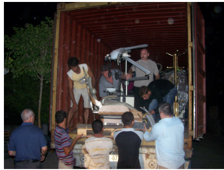
Unloading the container, September 2010