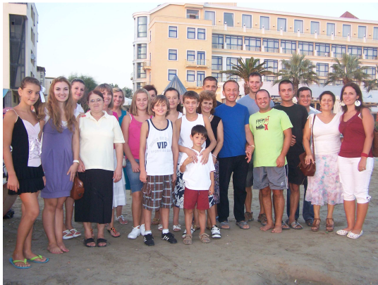
Witnesses on Dorian's baptism, August 22, 2010