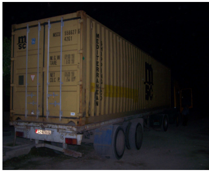
Container of medical supplies in Durres Port