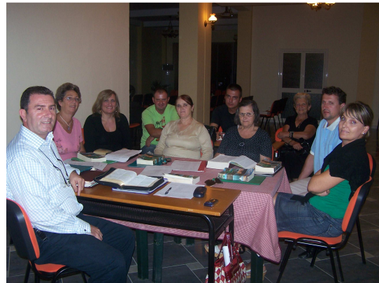
Adults Bible Study at Adriatic church, September 2010